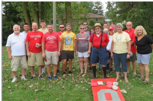
First neighborhood cornhole tournament September 2019

CCHTL is a charter member of the Lima-Allen County Neighborhoods in Partnership (LACNIP) non-profit organization. LACNIP works in a collaborate effort to improve the greater metropolitan community and make it a better place to live, work and play. Their website is www.lacnip.org